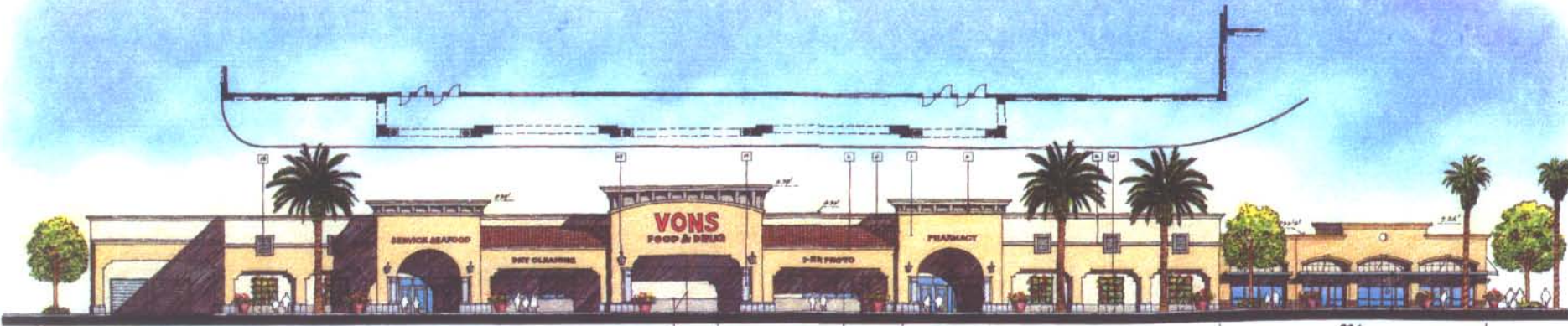
BUILDING M8 / EAST ELEVATION