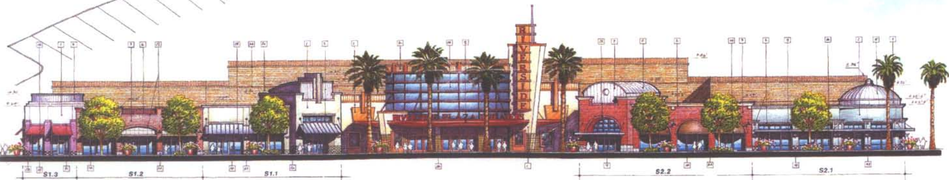
BUILDING S1 / SOUTH ELEVATION BUILDING M7 / SOUTH ELEVATION BUILDING S2 / SOUTH ELEVATION